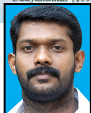
K.J. Kapil Dev (2010)