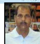
Om Parkash Dyan Chand Awardee (2002-03)