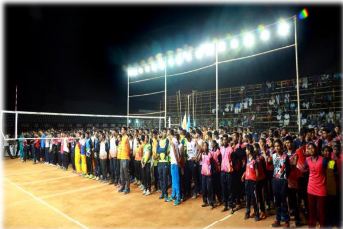
All the participating teams assembled during the opening ceremony