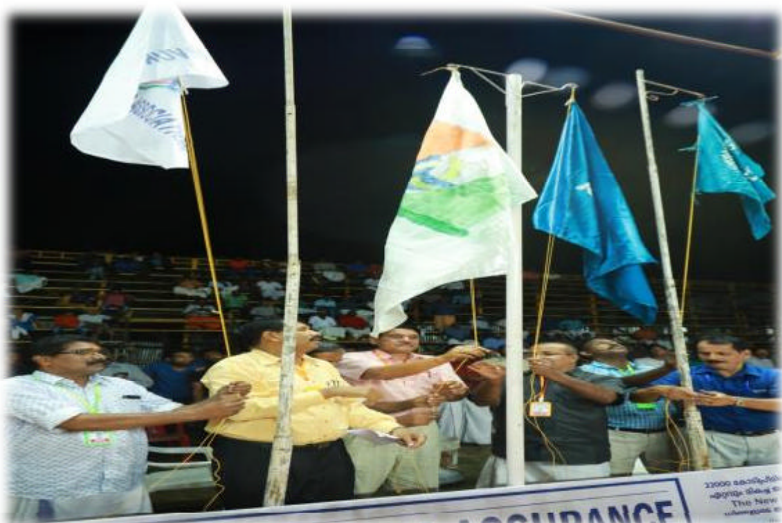
VFI flag being hoisted during the opening ceremony