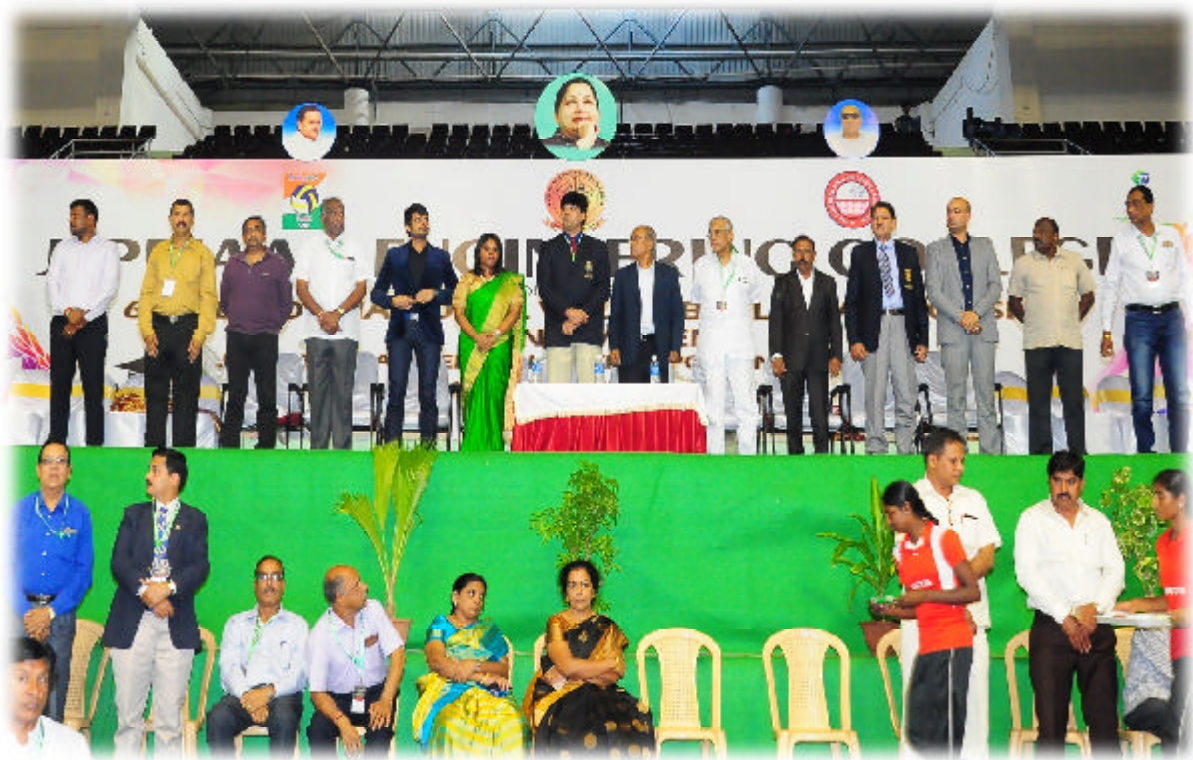
Delegates during the Opening Ceremony