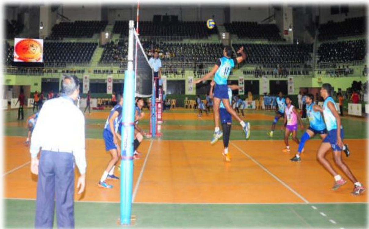
Action between Tamil Nadu & Services Men Teams