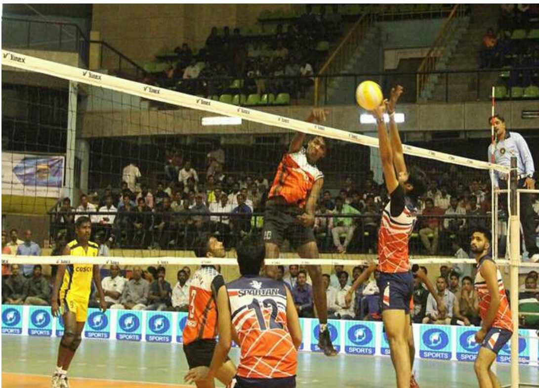
Inaugural Match Between Rajasthan Vs karnataka