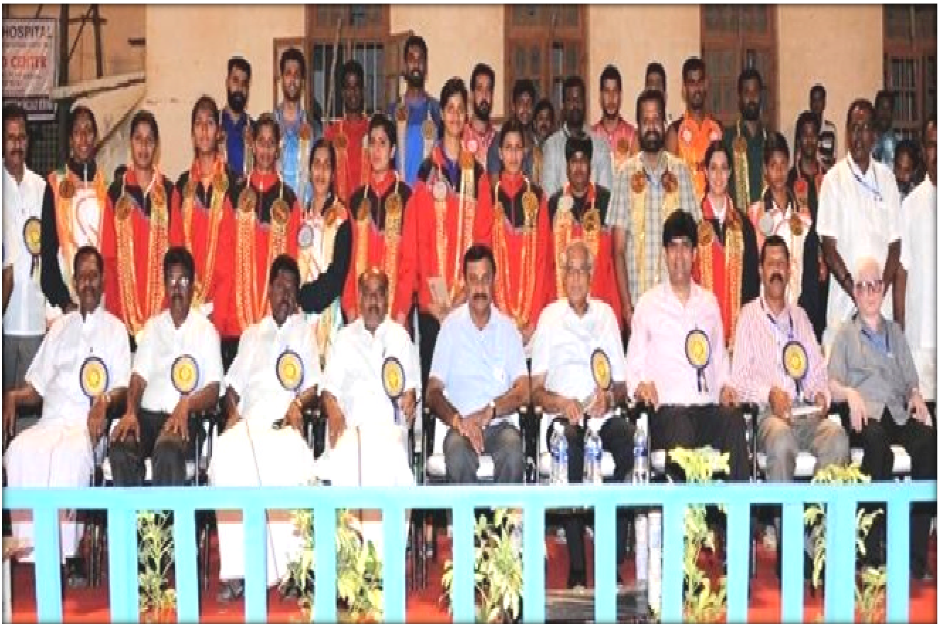
Indian Team Players being felicitated with cash award by Secretary General, VFI for winning Gols Medal in 12th SAF Games at Guwahali in both categories

Under the auspices of Tamil Nadu State Volleyball Association & Volleyball Federation of India