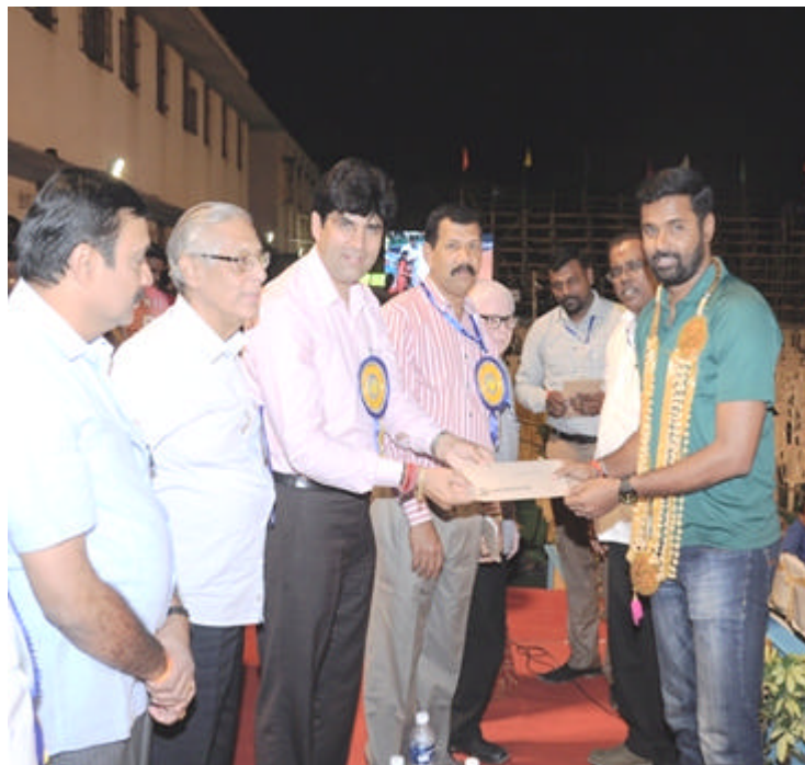
The Team Members of Indian Team winning Gold Medal in 12 th SAF Games at Guwahati being felicitated by Secretary General, VFI