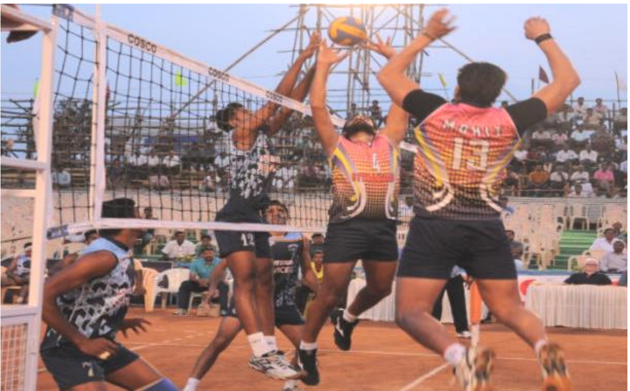
Action during match between Uttarakhand & Services