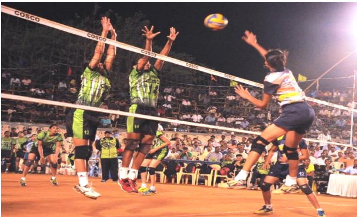
Action during women match between Indian Railways & Tamil Nadu