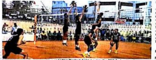
INTENSE TUSSLE: Indian Universities and Uttar Pradesh fight it out in the 29th Federation Cup volleyball tournament on Tuesday.