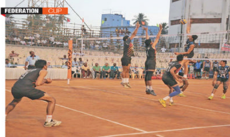
Action during the Indian Universities-Uttar Pradesh match in the Federation Cup volleyball on Tuesday. Indian Universities, mainly Pradesh players from SRM, won in straight sets.

திருப்பூர், 16.2.2016: திருப்பூரில் நடைபெற்று வரும் தேசிய கைப்பந்துப் போட்டியில், ஆண்கள் மற்றும் பெண்கள் அணிகளின் ஆரம்ப வெற்றி பெற்றது. தேசிய கைப்பந்து அமைப்பின் கீழ் நடைபெற்று வரும் இந்திய பல்கலைக்கழகம் அணி அணி வெற்றி பெற்றது. இந்திய பல்கலைக்கழகம் அணி 25-22, 25-23, 25-20 என்ற மூன்று செட்ஸ் வெற்றி பெற்றது. இந்திய பல்கலைக்கழகம் அணி 25-22, 25-23, 25-20 என்ற மூன்று செட்ஸ் வெற்றி பெற்றது. இந்திய பல்கலைக்கழகம் அணி 25-22, 25-23, 25-20 என்ற மூன்று செட்ஸ் வெற்றி பெற்றது.