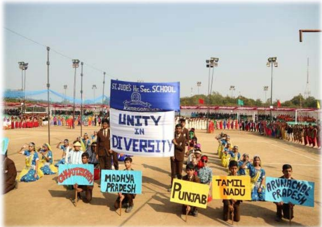
Cultural Display during the Opening Ceremony