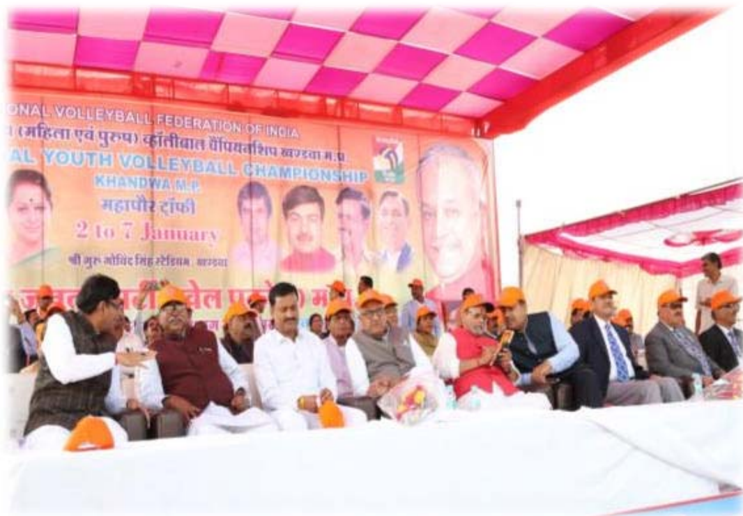
Hon. Shri Paras Jain, Minister in charge along with other dignitaries during the opening ceremony