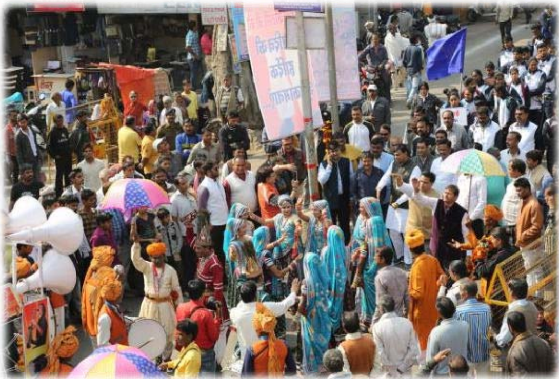
Cultural Activities during the rally before the opening ceremony