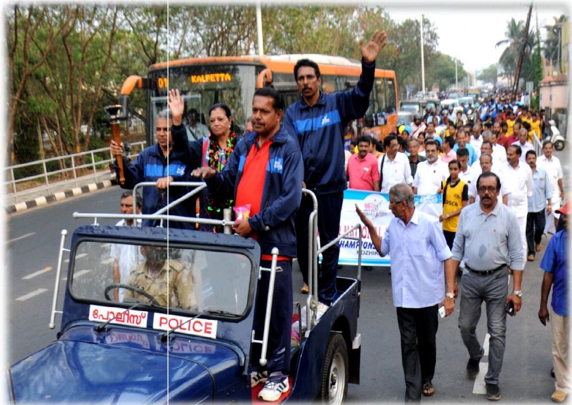
The Championship torch rallying through the city of Kozhikode