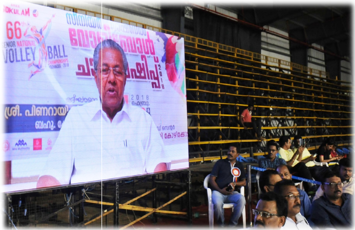
Hon'ble Shri. Pinarayi Vijayan, Chief Minister of Kerala through video conference inaugurating the Championship