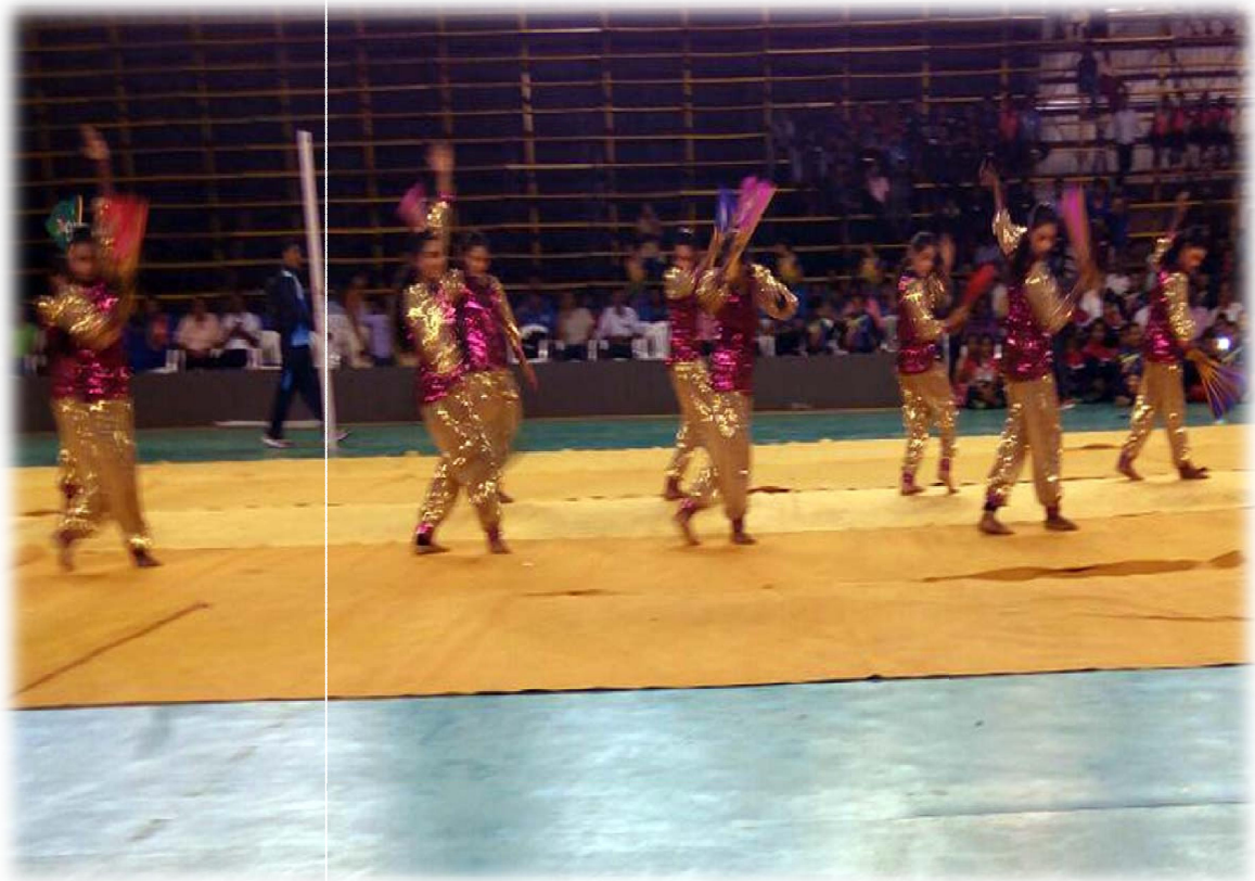
Cultural Programme during the inauguration ceremony