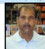
Om Parkash Dyan Chand Awardee (2002-03)